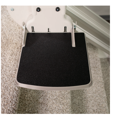
Not all options are shown.