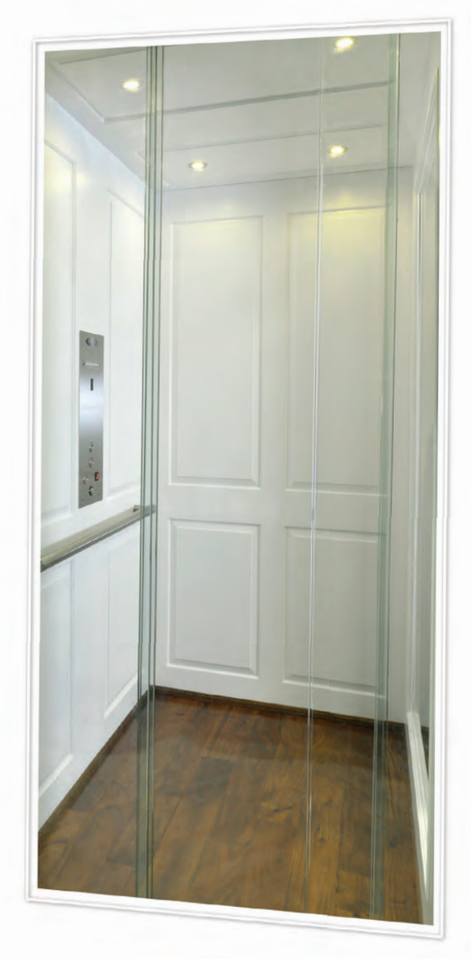
From modern to traditional, your Savaria Eclipse home elevator can be created to reflect your style. Our glass auto slim doors pictured above are just one way to build personalized luxury.